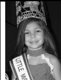
BRYSTOL WEST LITTLE MISS