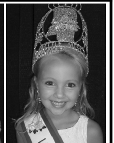
LONDON OLDHAM LITTLE MISS