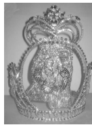
STATE Crown for Kids