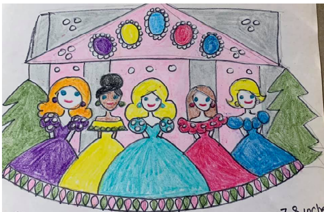
Left: Crown we are having designed for our winners with little Southern Belles across the front. All of the other contestants will receive a beautiful rhinestone tiara for competing.

Tickets will be sold at the door for family and friends who want to come cheer on their favorite contestants. Tickets are $10 per person for adults and kids. Kids 3 and under will be admitted free. PARENTS MUST PAY. Only contestants will be admitted free. All fees are non-refundable and non-creditable to our other pageants if contestants fail to show for the pageant or decides to withdraw. We make sure all kids go home with awards and goodies!!!