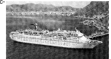
Winners of the MISS MAGNOLIA STATE Pageant For Ages 12-Over Win a CRUISE!

The pageant will be held on Saturday, May 9, 2015 at 2 p.m. at the Pine Valley School located on Hwy 32 East in Water Valley, MS. Registration will be from 1:00 to 1:30 p.m. You will need to get your contestant number at this time. You may call the director for directions to the pageant if needed. Sorry but checks will not be accepted at the door.