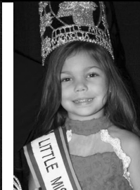
BRISTOL WEST LITTLE MISS