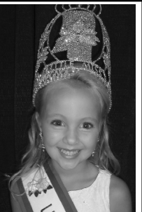
LONDON OLDHAM LITTLE MISS