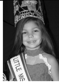
BRISTOL WEST LITTLE MISS