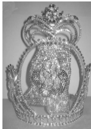
State Crown Awarded in July