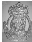
STATE Crown for Kids