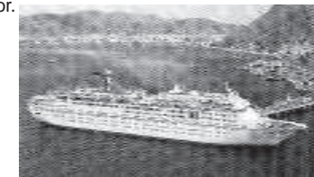
Winners of the MISS MAGNOLIA STATE Pageant For Ages 12-Over Win a CRUISE!

Local Pageant Director is an independent producer for the Miss Magnolia State Pageant Organization. State Pageant can not be held responsible for any loss, theft or injury during the local pageant. If any problems arise from the local pageant, state director reserves the right to handle the situation and make all final decisions.