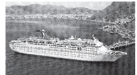
Winners of the MISS MAGNOLIA STATE Pageant For Ages 12-Over Win a CRUISE!

Local Pageant Director is an independent producer for the Miss Magnolia State Pageant Organization. State Pageant can not be held responsible for any loss, theft or injury during the local pageant. If any problems arise from the local pageant, state director reserves the right to handle the situation and make all final decisions.