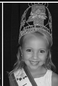
LONDON OLDHAM LITTLE MISS