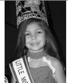
BRISTOL WEST LITTLE MISS