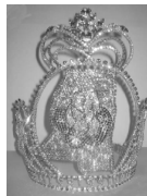
STATE Crown for Kids