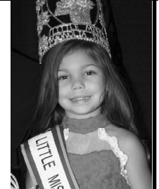
BRYSTOL WEST LITTLE MISS