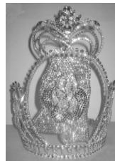
STATE Crown for Kids