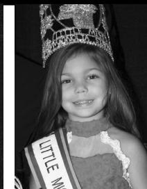
BRYSTOL WEST LITTLE MISS