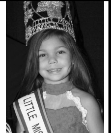
BRYSTOL WEST LITTLE MISS