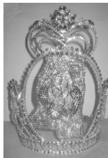
STATE Crown for Kids