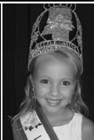
LONDON OLDHAM LITTLE MISS