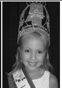
LONDON OLDHAM LITTLE MISS