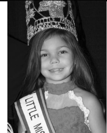
BRYSTOL WEST LITTLE MISS