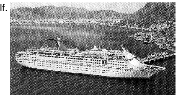
Winners of the MISS MAGNOLIA STATE Pageant For Ages 12-Over Win a CRUISE!

The pageant will be held on Saturday, April 8, 2017 at the Holiday Inn, located at 495 Springridge Road, Clinton, MS 39056. Registration will be from 1 to 1:30 p.m. You will need to get your contestant number at this time. You may call the director for directions to the pageant if needed. Sorry but checks will not be accepted at the door. The pageants usually last about an hour and a half.