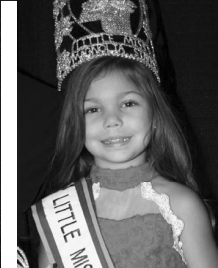
BRYSTOL WEST LITTLE MISS