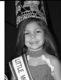
BRYSTOL WEST LITTLE MISS