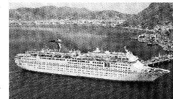
Winners of the MISS MAGNOLIA STATE Pageant For Ages 12-Over Win a CRUISE!

Local Pageant Director is an independent producer for the Miss Magnolia State Pageant Organization. State Pageant can not be held responsible for any loss, theft or injury during the local pageant. If any problems arise from the local pageant, state director reserves the right to handle the situation and make all final decisions.