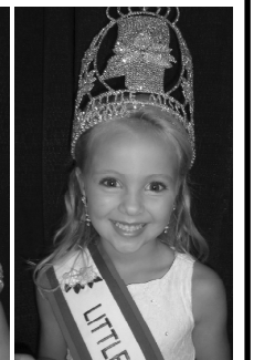
LONDON OLDHAM LITTLE MISS