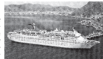
Winners of the MISS MAGNOLIA STATE Pageant For Ages 12-Over Win a CRUISE!

Local Pageant Director is an independent producer for the Miss Magnolia State Pageant Organization. State Pageant can not be held responsible for any loss, theft or injury during the local pageant. If any problems arise from the local pageant, state director reserves the right to handle the situation and make all final decisions.