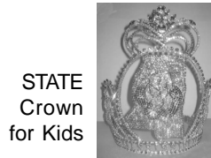
STATE Crown for Kids