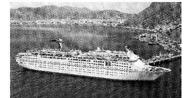
Winners of the MISS MAGNOLIA STATE Pageant For Ages 12-Over Win a CRUISE!

Local Pageant Director is an independent producer for the Miss Magnolia State Pageant Organization. State Pageant can not be held responsible for any loss, theft or injury during the local pageant. If any problems arise from the local pageant, state director reserves the right to handle the situation and make all final decisions.