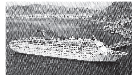
Winners of the MISS MAGNOLIA STATE Pageant For Ages 12-Over Win a CRUISE!

Local Pageant Director is an independent producer for the Miss Magnolia State Pageant Organization. State Pageant can not be held responsible for any loss, theft or injury during the local pageant. If any problems arise from the local pageant, state director reserves the right to handle the situation and make all final decisions.