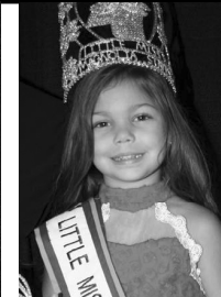
BRYSTOL WEST LITTLE MISS