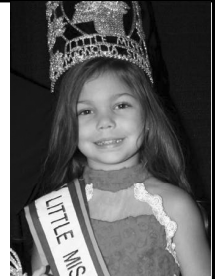
BRYSTOL WEST LITTLE MISS