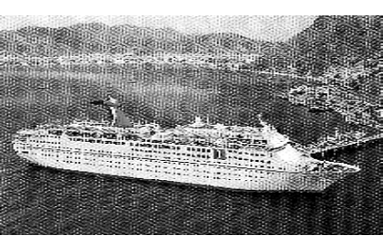
Winners of the December STATE Pageant For 12-Over Win a CRUISE!