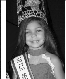
BRYSTOL WEST LITTLE MISS