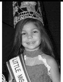
BRISTOL WEST LITTLE MISS