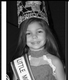
BRYSTOL WEST LITTLE MISS