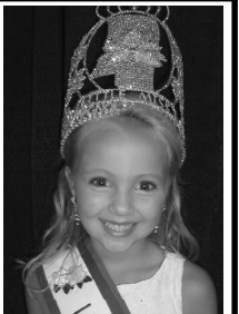
LONDON OLDHAM LITTLE MISS