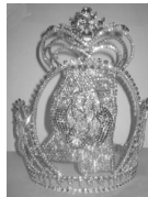
STATE Crown for Kids

_____ TOTAL We will accept door entries with late fee if you call director ahead of time