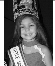
BRYSTOL WEST LITTLE MISS