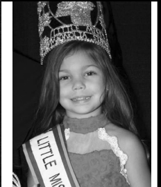
BRISTOL WEST LITTLE MISS