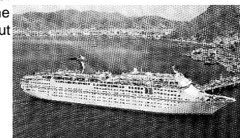
Winners of the MISS MAGNOLIA STATE Pageant For Ages 12-Over Win a CRUISE!

Local Pageant Director is an independent producer for the Miss Magnolia State Pageant Organization. State Pageant can not be held responsible for any loss, theft or injury during the local pageant. If any problems arise from the local pageant, state director reserves the right to handle the situation and make all final decisions.