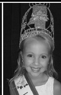
LONDON OLDHAM LITTLE MISS