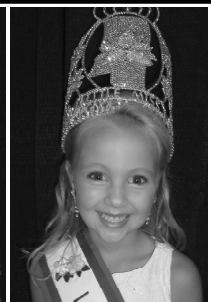
LONDON OLDHAM LITTLE MISS