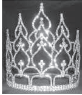
An Example of an ad sales crown. Styles may vary.

There will be an attractive, professionally produced program book at the pageant. Ad pages are $150 for a full page; $75 for a half a page; and $40 for ¼ page. Contestants may sell ads to family, friends and businesses. It is easy to earn your entry free by selling just a few ads. This way, the expense of the pageant will not come out of your own pocket and you are giving merchants in your community the chance to be recognized. EVERY CONTESTANT IN THE PAGEANT IS REQUIRED TO SELL 1/4 PAGE. If you won a preliminary, which all of you ages 0-11 did, we want you to have a picture taken with your crown and banner on and use that picture on your ad. All you have to do is draw out on a sheet of paper what you want to appear on your ad and we will get our graphic artist to typeset and create the page for you at no additional charge for the set up. Please include pictures to use on your ad. This will make a very attractive program book. This book is a great souvenir to keep throughout the years. PLEASE NOTE: 3 pages of ads sold will earn you a free entry. If you just sell one or two pages that does not go towards the entry fee, ONLY a grand total of 3 pages will earn you a free entry! Ads totaling under 3 pages are not deducted from entry fee.